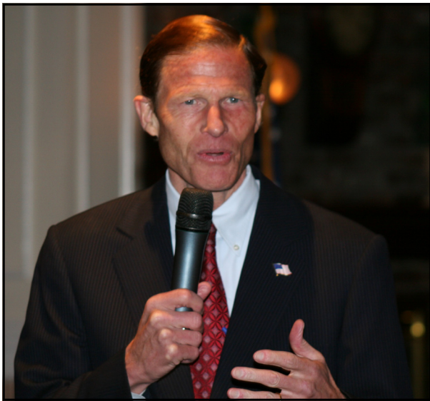
Connecticut Attorney General